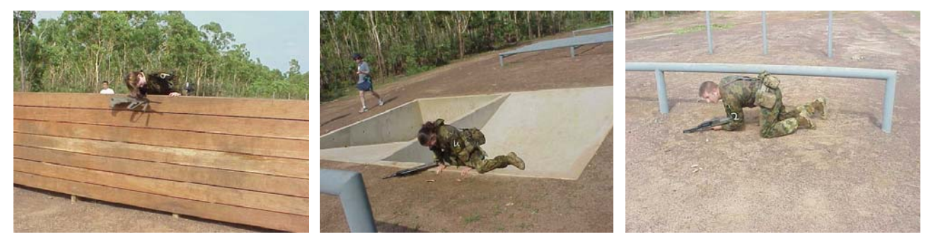
Figure 1. The modified wall, pit and added go-to-ground bar of the RDJ course

iii) A modified-RDJ course was used in this experiment, differing from the regular course in that the wall was 1.5 m high, the pit was reversed such that the soldiers ran down to the bottom and climbed out, a bar was added just prior to the turn around point that required the soldiers to drop to the ground (Figure 1). These modifications resulted in the course being 5 m longer. In addition, a flat wooden wall (no half logs included) was constructed. Consequently, there was no leverage points to aid in scaling the wall. The lower flat wall is a more realistic representation of urban terrain. The reduction in wall height and reversing of the pit were designed to reduce the injury risk, whereas the go-to-ground bar was to simulate a fire and movement activity that was not previously included in the RDJ. The webbing mass carried for both males and females was 10.4 \pm 0.8 kg and 9.9 \pm 0.4 kg, respectively.