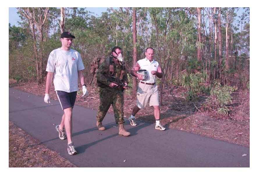
Figure 2. Measurement of oxygen consumption using a portable metabolic system

vi) Perceived effort of work, body temperature and thermal comfort were recorded at 5-km intervals using standard scales. Profile of mood states (POMS) and a psychometric test battery (Thinkfast®) were administered ~15 min prior to the march and ~30 min following the march.